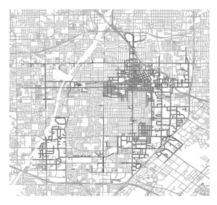
Figure 1a. Santa Ana Enterprise Zone, City Streets and Enterprise Zone as of 2004.