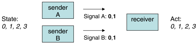
Fig. 2 A signaling game with two senders and one receiver

senders and the receiver add a ball of the successful signal or act type to the appropriate urn on success and simply replace the drawn balls on failure. We will also suppose uniformly distributed states of nature.