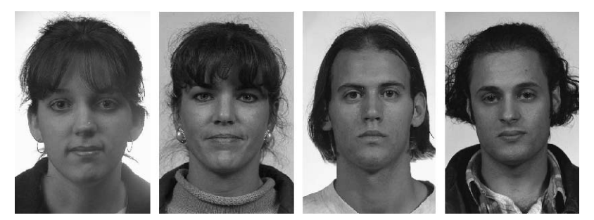
Figure 2. Example of different-person image pairs with similar external features (left) and dissimilar external features (right).